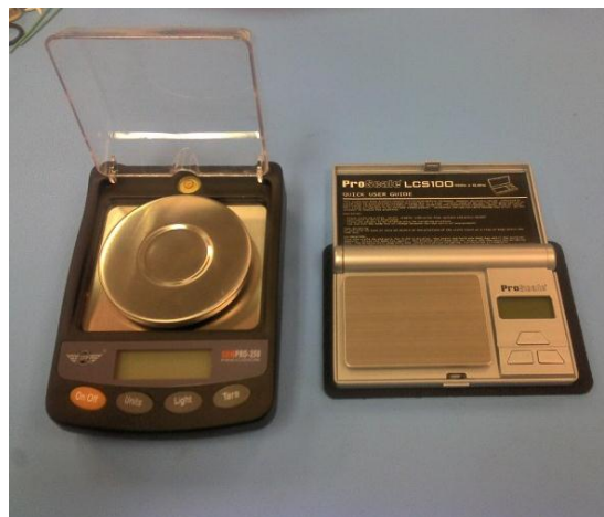
Figure 3: These are two portable balances that would be suitable for use in the field. It is suggested to use a balance that can read to 0.01 g.

of the vial with the soil to verify we had added 5 grams. [1] In the field, it may be convenient to use a portable balance like the ones shown in Figure 3 .