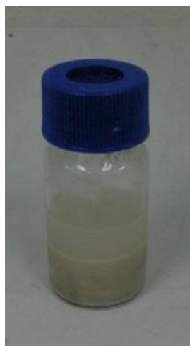
Figure 2: This is a 20mL VOA vial containing our soil sample and the methanol used to extract it.

It is difficult to know when a sample contains a high concentration and the EPA recommends screening samples. They recommend that you start with a large dilution and work your way up to a more concentrated sample. Since our sample contains analyte concentrations well above 200µg/kg, we used methanol extraction.