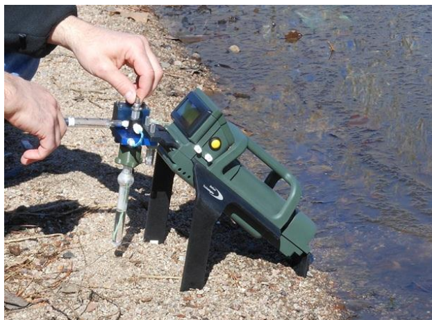
Figure 1: This is the FROG-4000™, the world's most portable GC system.

Weighing less than 5 pounds, the FROG-4000™ (shown in Figure 1 ) is the smallest portable GC system on the market today. The FROG™ uses MEMS components and designer nanomaterials to deliver the same detection capabilities of a traditional bench top GC system but at a fraction of the cost and size. The FROG-4000™ is equipped with a purge-and-trap system for analyzing water and soil samples in the field.